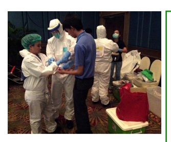
Response team for Ebola

Degree Title - Certificate of Accomplishment in International Field Epidemiology Training Program – Thailand